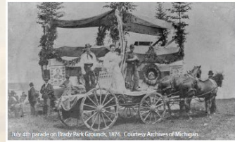
July 4th parade on Brady Park Grounds, 1876.