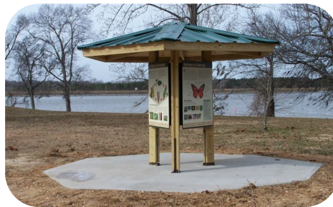
William Dannelly Reservoir