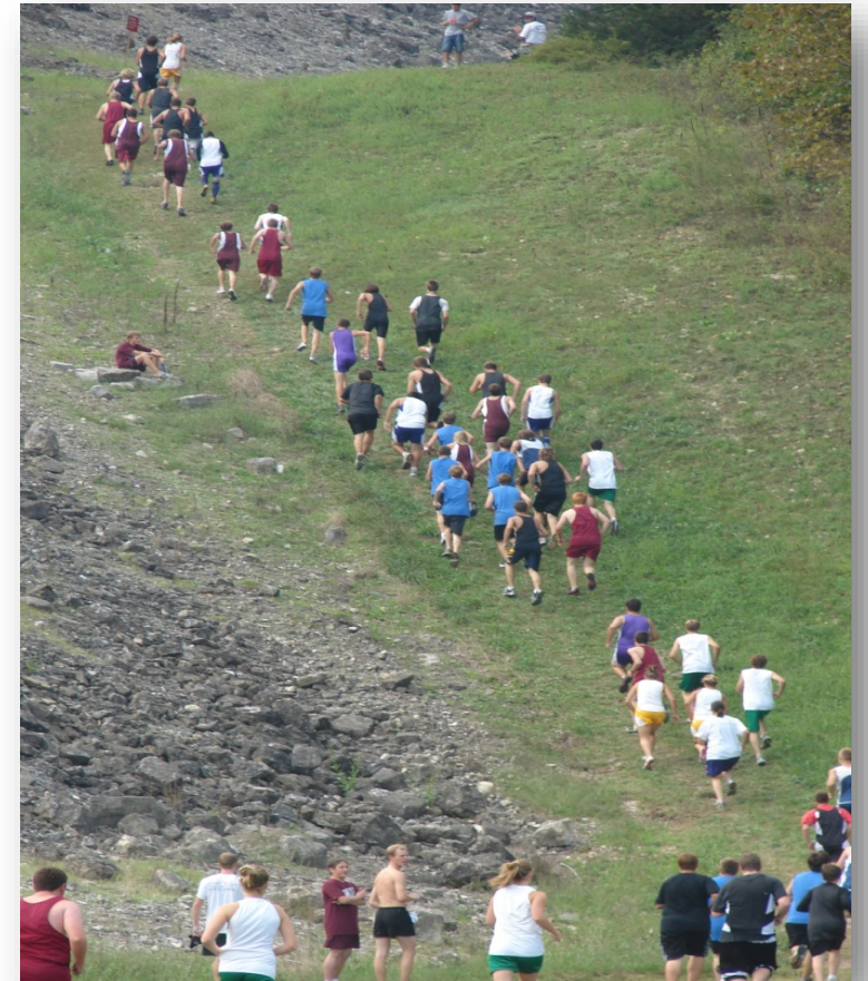
Pomme de Terre Lake