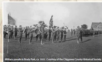
Military parade in Brady Park, ca. 1925.