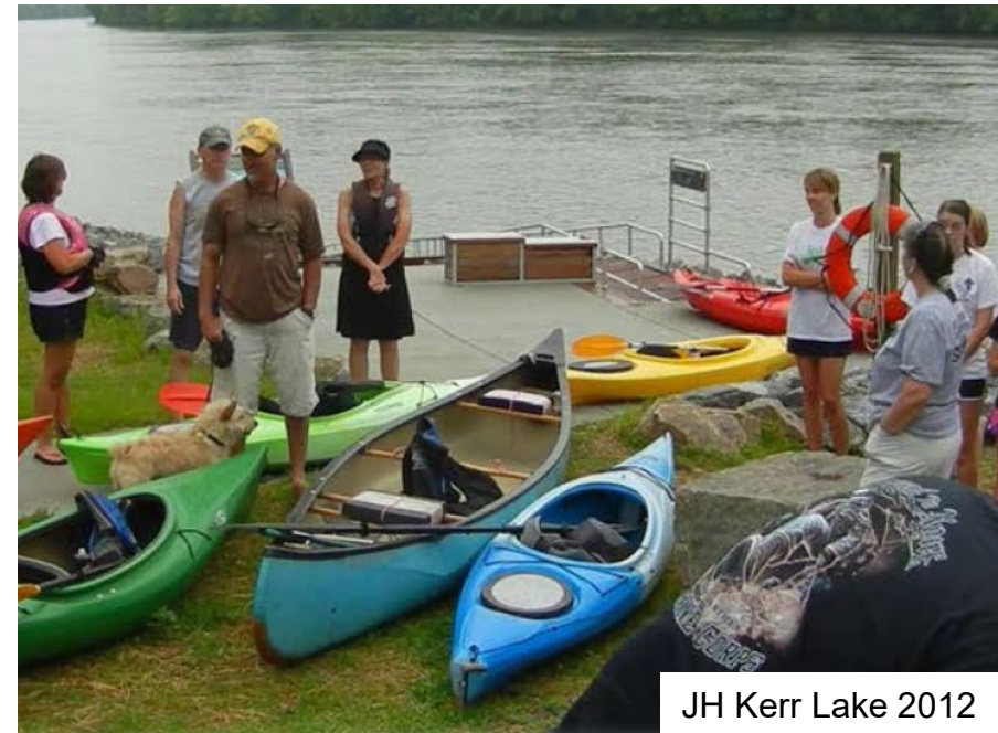
JH Kerr Lake 2012