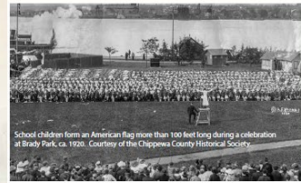
School children from an American flag more than 100 feet long during a celebration at Brady Park, ca. 1920.