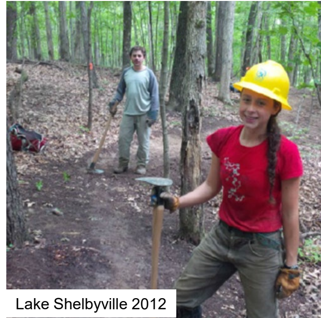
Lake Shelbyville 2012